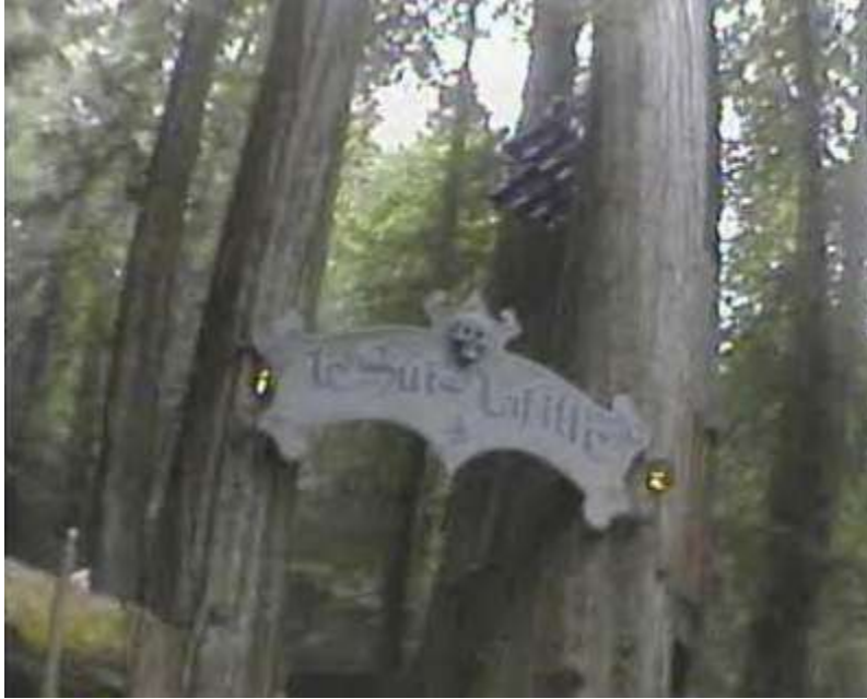
Picture of the entrance to the Bohemian Grove annual meeting place.

The meeting features many public speakers and the highlight of the meeting is a (mock?) human sacrifice of a baby thrown into the fire in front of a 45' stone owl named "Moloch". This is pure satanic Evil and that's what our leaders are into. Hard to believe? Austin, Texas journalist Alex Jones infiltrated the meeting on July 15th, 2000 and secretly taped this annual ritual.