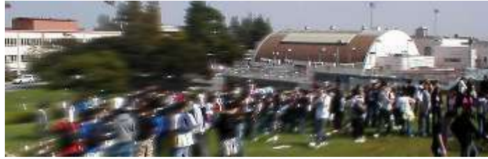
(above) Students run for their lives