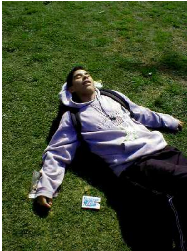
(above) Student is trampled to death by the stampeding crowd.

It is common knowledge that the real meaning of WASC is Witchcraft And Satanic Cult. The seemingly endless polls about what students think about block scheduling is no more than test questions to see who is vulnerable to be snatched by the cult. Although that is widely known, most thought the Witchcraft and Satanic Cult was a pacifist group... that is until March 5. According to inside sources, WASC's goal was to incite mass rioting by means of creating a major tragedy. In fact riots did in fact break out. Students were so riled by the incident that two students, who apparently had superhuman strengths (most likely due to the flow of adrenaline) were able to rip a trashcan from the metal chain and steal the trashcan. The administration says it will "find the culprits of this utterly heinous crime". Other students ran to the parking lot, and after discovering the Mercedes Benz's didn't protect them from the swarming bees, they ran to the adjacent Sempra Facility where they jumped over the fence just to land in a pool of bubbling sulfuric acid.