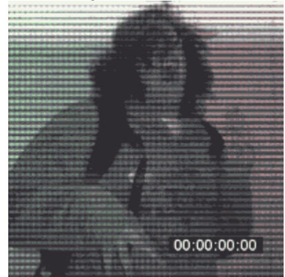
(above) School surveillance camera catches footage of student having a seizure

As the students of Beverly Hills High School know all too well, the fire alarm system is accompanied by the PRDLESCIDBNW v.2.03 strobe light. It was these lights that would trigger the string of violent epileptic seizures throughout the school. According to neurosurgeon Alice Ferguson, the pulsating light that Beverly’s fire alarm strobes emit is within 3 nanohertz of the brainwave impulse spectrum of the human brain. In practice, this means the strobe can trigger demonic seizures that, according to Ferguson, could quite possibly result in death.